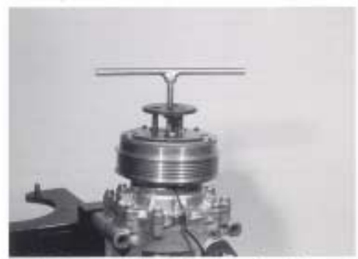
Fig 2. Removing Clutch Armature Assmbly

If armature cannot be removed by hand, use the puller as follows Align puller center bolt to compressor shaft. Install (hang) the three puller hooks into the holes on front plate. Turn center bolt clockwise until armature disengages from the shaft.