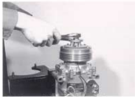
Fig 1. Removal of Armature Fixing Nut

Insert three prongs of armature securing tool into the three holes on the armature. Then, serving the tool by hand remove the armature fixing nut with a 14mm socket.