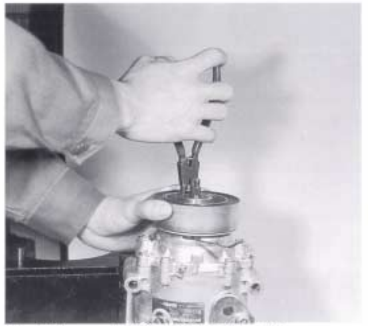
Fig 5. Removal of Clutch Coil Assembly