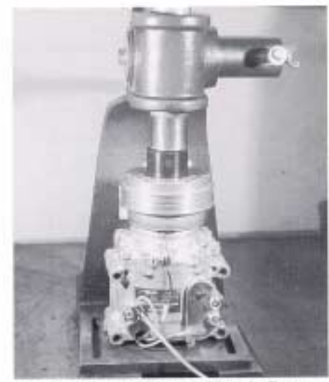
Fig 7. Installation of Clutch Rotor