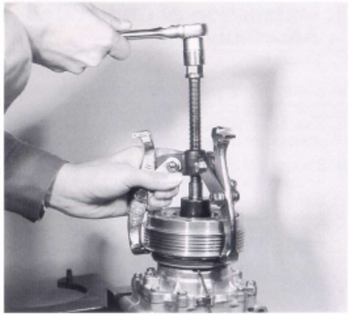
Fig 4. Removal of Clutch Rotor

The clutch rotor is a tight fit to the front boss. With shaft protector (2143a) in place, remove with puller as shown in figure 4. The clutch bearing is not a serviceable item for the TRS090 / 105. The rotor and bearing assembly has to be replaced as one unit.