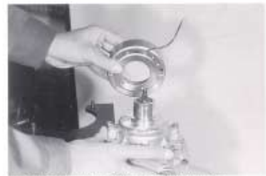
Fig 6. Installation of Clutch Coil Assembly