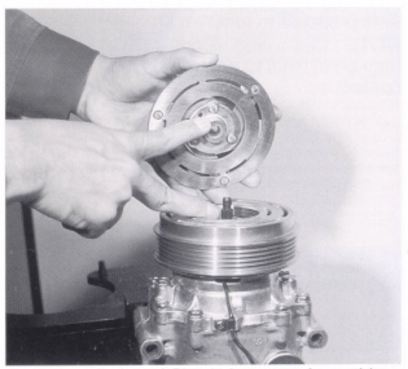
Fig 9. Installation of Clutch Armature Assembly

Measure air gap between clutch armature and clutch rotor using feeler gauges as illustrated in Fig. 10. Recommended air gap is 0.35 ~ 0.65mm. If adjustment of the air gap is indicated, remove fixing nut and armature assembly (refer preceding instructions), then add or remove shims as necessary to achieve the recommended air gap.